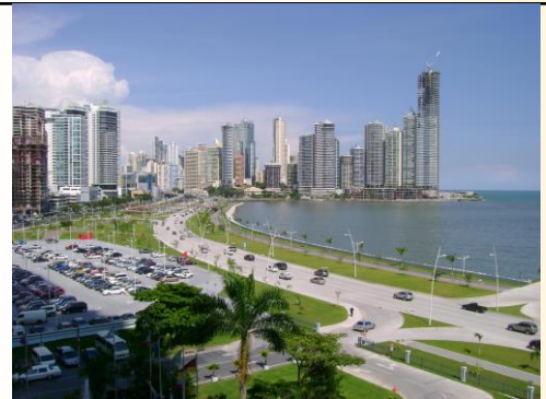
Panama City, Panama

Panama City is the capital and largest city of Panama. It is located close to the Columbia-Panama border, which divides North and South America. Although Panama City is located in North America, it is interesting to note that the container terminals and port facilities in the city are operated by Hutchison Whampoa in Hong Kong.