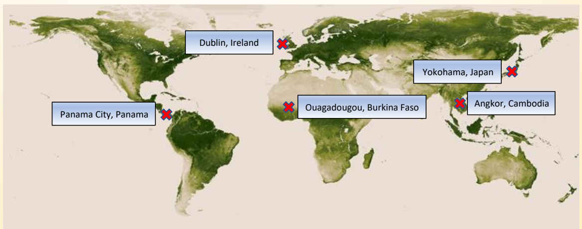
Map of the four JCI Area Conferences & JCI World Congress in 2020