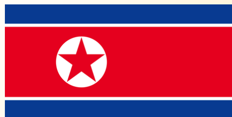
Flag of North Korea