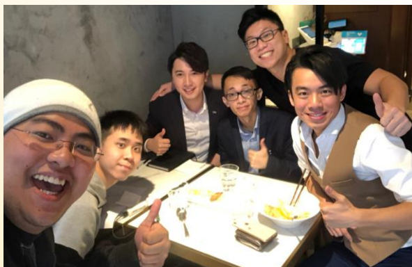
The first Membership Affairs Area Meeting was held on 18 December 2019. All team members are committed to organising a series of fellowship gatherings and events for our members.

Mainland China is a fantastic place to work and travel. I enjoyed my livelihood travelling from Hong Kong and Guangzhou. I hope that the above practical tips are useful for you!