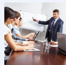
Advisory and Training Services