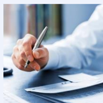
Company Secretarial Services