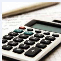
Accounting and Business

To equip and contribute; to stay positive and optimistic; to appreciate and treasure; to do exercise and have a healthy life.