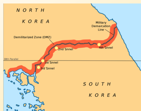
The DMZ denoted by the red highlighted area.