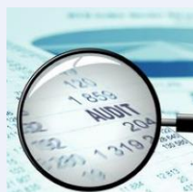
Audit and Assurance Services