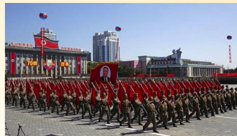
Massive military parade in North Korea.

This time I have really experienced something totally different from my previous journeys. Upon arrival, all of us were told to hand in mobile phones and cameras in order to comply with their local immigration legislation. We were also instructed to strictly comply with their "List of Dos and Don'ts" during the study tour.